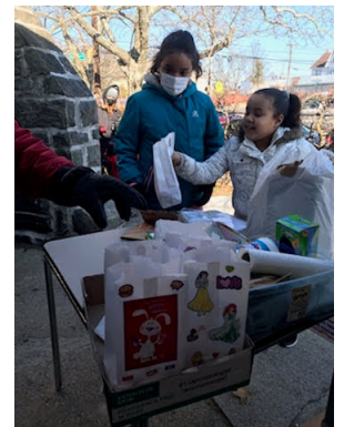
St. Wilfrid's 2/5/22

I agree: This church does a lot. It's impressive and many, many people benefit from its acts of charity and generosity. Yet, no one would disagree that there is much to be done and as long as there is physical or emotional need, injustice, oppression, or marginalized people — the church much never rest nor consider its work done.